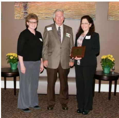
Awards Banquet from the 18th

There will be no Pancake Breakfast in June, July or August. However, Coffee & Donuts will be after the 8:00 & 10:00 masses on June 5 and June 19. Keep July 18 open for the Ice Cream Social and we will be looking for donations for our August Garage Sale.