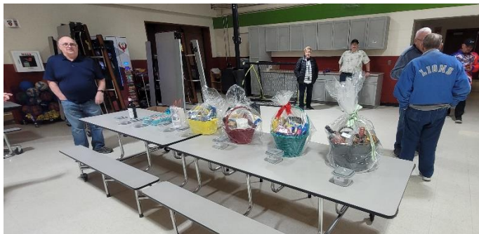
Prize Table from Cornhole Tournament

We'll work on what we can. The more help, the better chance we have at getting most of this done.